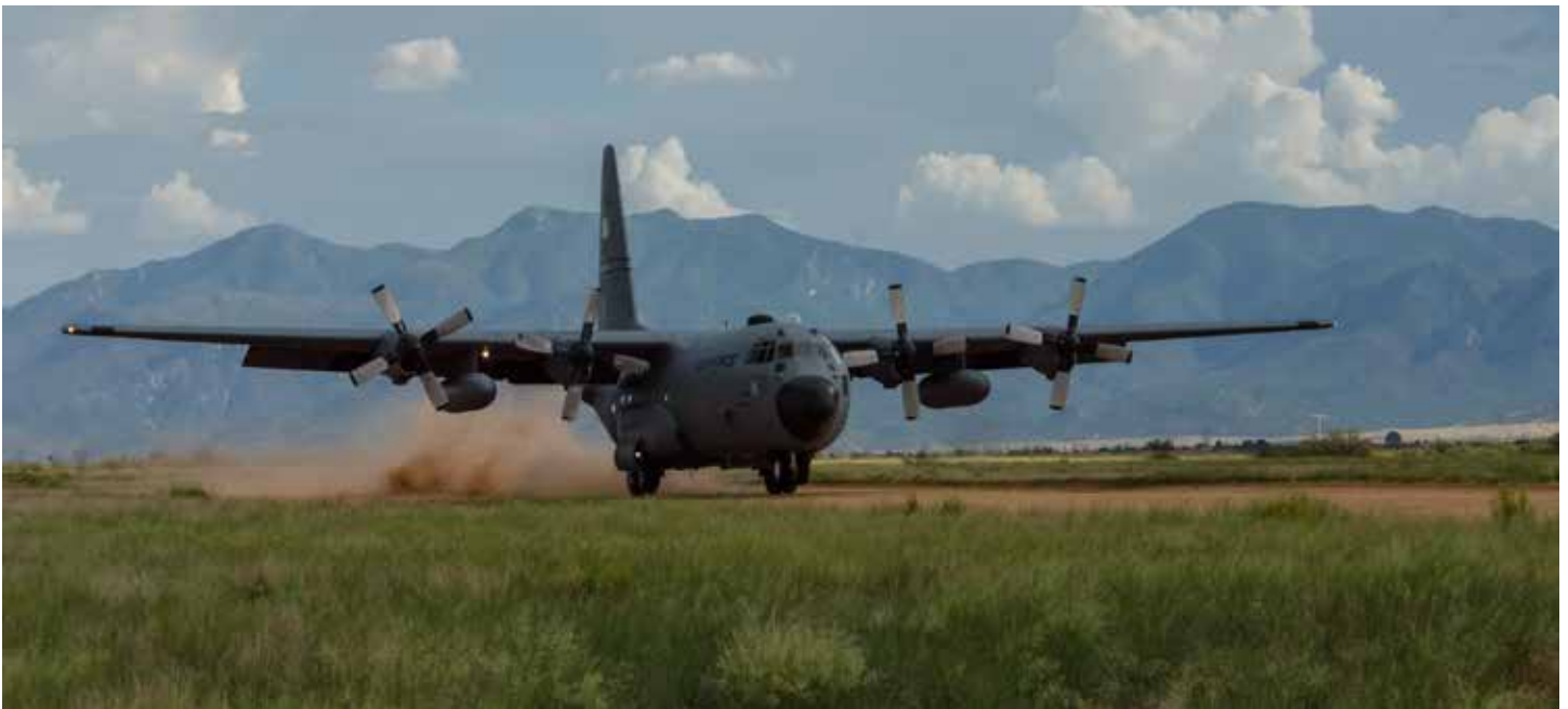
A U.S. Air Force C-130H Hercules lands on Hubbard Landing Zone at Fort Huachuca, Ariz., during a mobility flying course conducted by the Advanced Airlift Tactics Training Center.