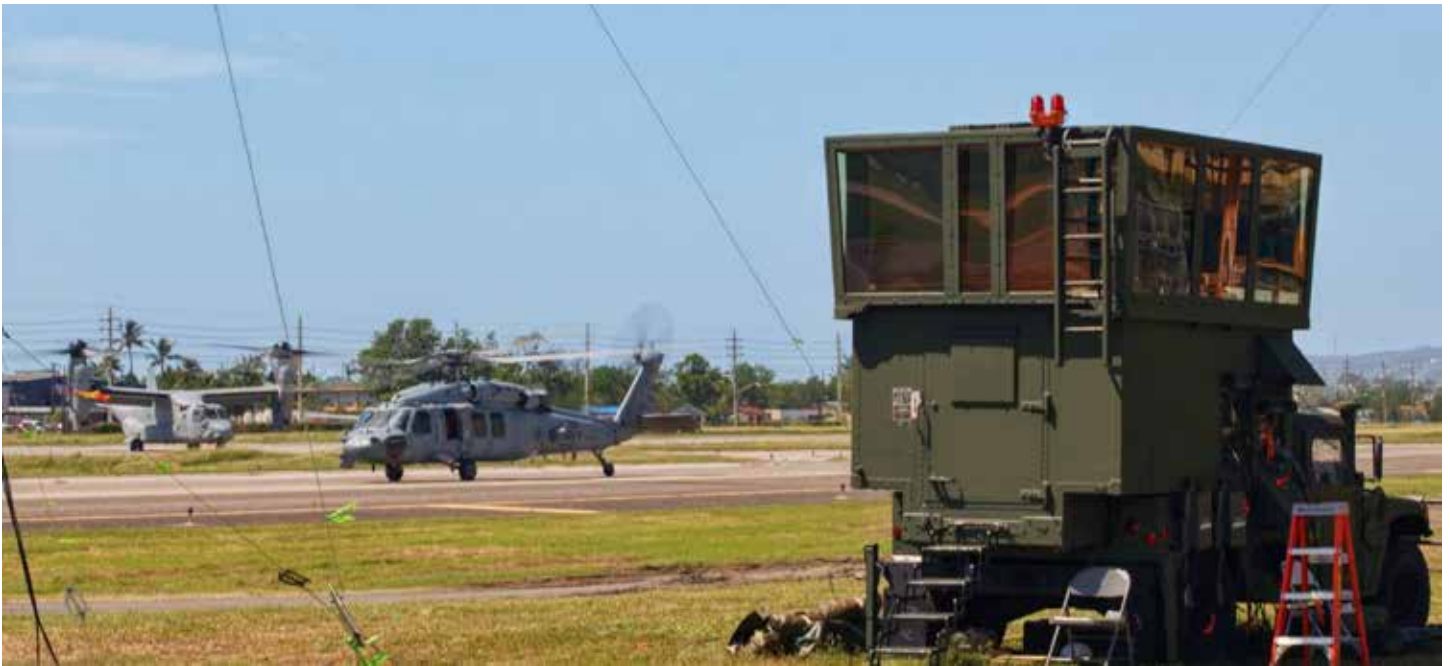
A mobile air traffic control tower assigned to the 241st Air Traffic Control Squadron sits at Mercedita Airport in Ponce, Puerto Rico, on Oct. 30, 2017. The squadron was activated to assist with hurricane relief efforts.

Over the course of FY 18, the 241st ATCS faced numerous challenges on multiple fronts. Supporting national policy, safeguarding territorial citizens from natural disasters or enabling the operational testing and evaluation (OT&E) of a new deployable air traffic control approach landing systems are just a few. As always, even with nearly 50 percent of the squadrons members deployed, the energies of the men and women of this organization met each one of these tests, overcame any obstacles placed before them, and successfully carried out the mission.