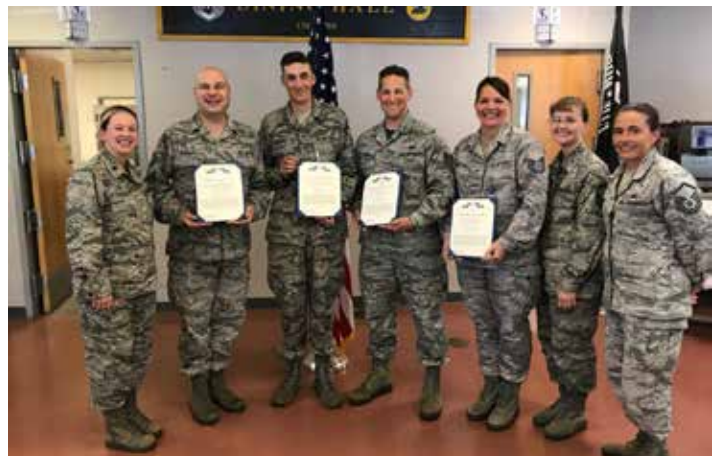
139th leadership presents Airmen with the 131st BW, Air Force Commendation Medals for their selfless support during deployment operations.

office next year. The relocation of the testing office has allowed for a larger room with nine testing computers available. 139th Force Development continues leading ANG metrics in resourcing and executing Mission Essential Skills Training Days. Additionally, NGB report cards recently recognized our FDO "Excellence" in shipping members to basic and technical schools. This has been a recent change in virtually shipping