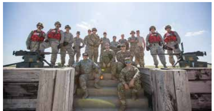
U.S. Airmen with the 139th Security Forces Squadron pose for a photo during training with a M2 Browning Machine Gun at Fort Riley, Kan., September 8, 2018.

we project power. At the heart of this no-fail mission is the elite defender who must be the best in the world at 21st century integrated base defense.” Security Forces career field leadership produced a comprehensive plan aimed at revitalizing the career field. Significant changes are on the horizon for FY19. These changes include a Security Force specific PT test, the new M18 service pistol, new standardized gear, tier level training, proficiency firing requirements, and defender basic military training flights, to name a few of the changes heading our way. The 139th SFS is prepared and ready to accept these new challenges not only in our own squadron, but for our career field. We stand ready to be the example all other Security Forces Squadron’s model themselves after, whether active duty, guard, or reserve.