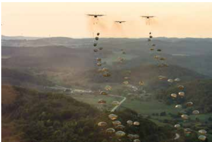
U.S. Army soldiers from the 173rd Airborne Brigade, as well as soldiers from various allied nations, parachute from U.S. Air Force C-130 aircraft onto a drop zone in Germany, Sept. 19, 2018.

Throughout all of this change, the operations group continued to excel and set the “Gold Standard” for tactical airlift and air traffic control in the Air National Guard.