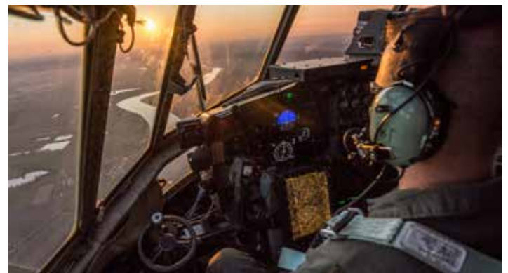
U.S. Air Force Maj. Greg Hafley, a C-130 Hercules aircraft pilot, participates in a personnel drop during Saber Junction 18 above Germany, Sept. 19, 2018.

During AEF operations, the unit broke the single month flying hours record with nearly 1,000 hours flown in the month of March. This record had been held for a decade prior and the 139 OG accomplished this with one tail less than the prior unit. Air crews also averaged 20 sorties per day and accumulated a staggering 3,604 total combat hours flown.