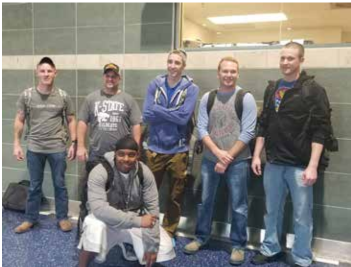
U.S. Airmen assigned to the 139th Force Support Squadron-depart for a 6-month deployment in support of contingency operations.

Our deployment function processed all 326 wing members out the door over a three month period and then welcomed them home over 35 days, hosting 25 receptions; to include seven from FSS. Furthermore, FSS processed 24 passports and 82 promotions, 1,398 ID cards, and 117 enlistments.