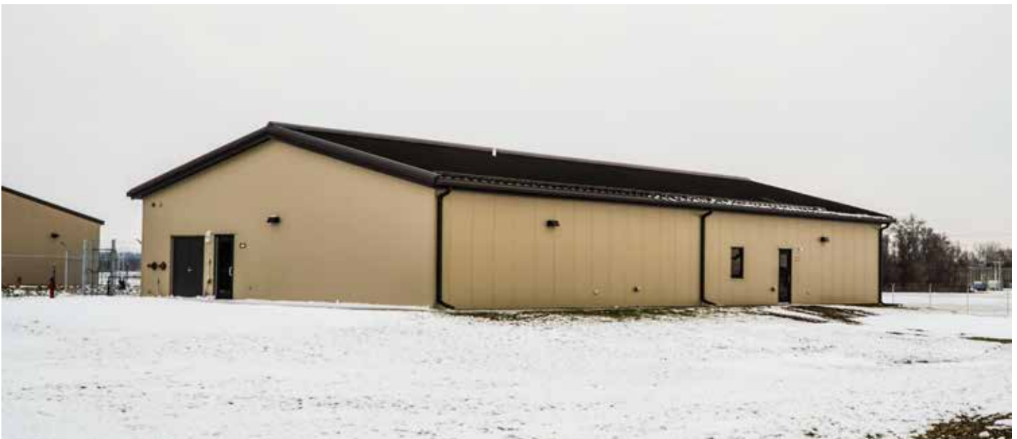
A new building for Detachment 1, 139th Medical Group, is near completion at Rosecrans. Det. 1 is responsible for the medical support of the Missouri National Guard's Homeland Response Force. The construction is part of a long term plan of moving the base north of its primary location.

*Education benefits are based on the enlisted personnel pursuing undergraduate education. The total 4 year process for a Bachelor's degree was then broke down annually and based on 60% of the total enlisted personnel utilizing their benefits.