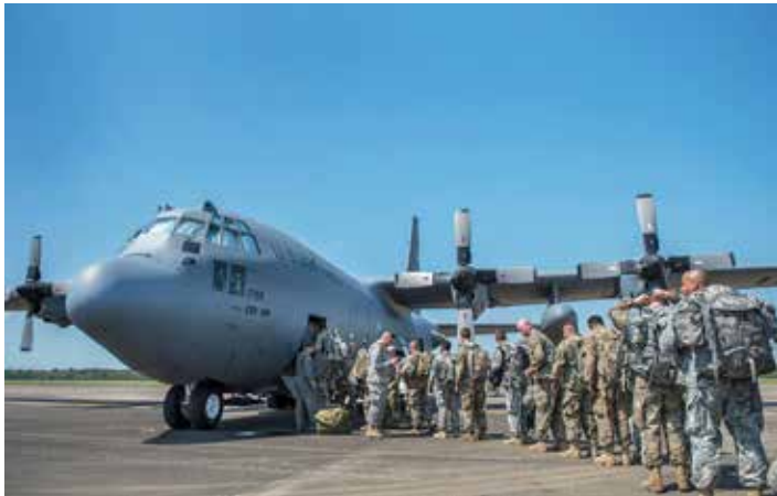
Soldiers and Airmen from the Louisiana National Guard board a C-130 aircraft from the 180th Airlift Squadron, Missouri Air National Guard for transport to Puerto Rico at Naval Air Station Joint Reserve Base New Orleans on Sept. 30, 2017. The Louisiana National Guard is sending more than 300 Soldiers and Airmen to support recovery efforts following Hurricanes Irma and Maria.

During this readiness period ARMS also supported hurricane relief, Saber Junction, AEF along with local flying operations. Maintained aircrew proficiency as primary Comsec Responsible Officers for the entire group, AATTC and WIC missions. The efforts of ARMS provided 850 sorties, 1968 total hours, 86 AO's, 2210 Logs, and 1,105 full steps for the year.