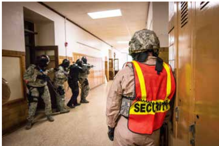
U.S. Airmen with the 139th Security Forces Squadron, Missouri Air National Guard, conduct small team tactics training at an abandoned elementary school, in St. Joseph, Mo., June 2, 2018. The training utilizes simunition rounds, which are paint-based rounds that provide a realistic training environment.

The motivation and dedication from the 139th Security Forces Squadron remained steadfast upon the return of our deployed members. Immediately following their return was the Sound of Speed Air Show. Air show operations requires all "hands on deck" to ensure the safety of the attendees, performers, and assets on our installation. Our defenders answered the