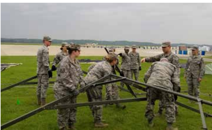
U.S. Airmen with the 139th Force Support Squadron set up tents during annual training.

Overall, FSS has been running a sprint to support our members and their families thru deployment preparation, sending those members out the door, and welcoming them home, at the same time maintaining our mission of supporting the home station. We thrive on taking care of mission first and people always, because supporting our Airmen and families is our mission.