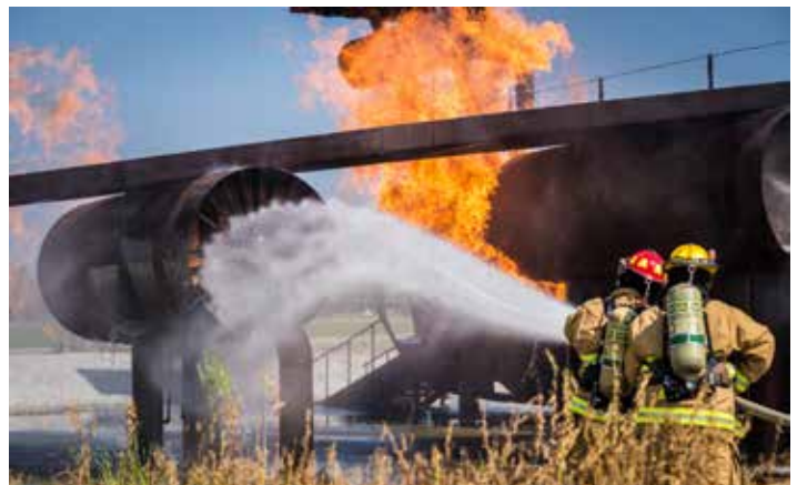
Firefighters assigned to the 139th Fire Emergency Services, Missouri Air National Guard, battle a simulated aircraft fire at Offutt Air Force Base, Neb., July 16, 2018. The civilians and airmen were conducting an aircraft live-fire exercise as part of their annual training.

The North Development Plan was a design contract in which the 139th updated their base master plan. This plan identified the order in which our facilities would be constructed on the north portion of the airfield. The work that was done with this design, which was completed in January of 2018, along with the future mission initiatives has helped to propel this effort to get the entire base relocated to the north end of the airfield.