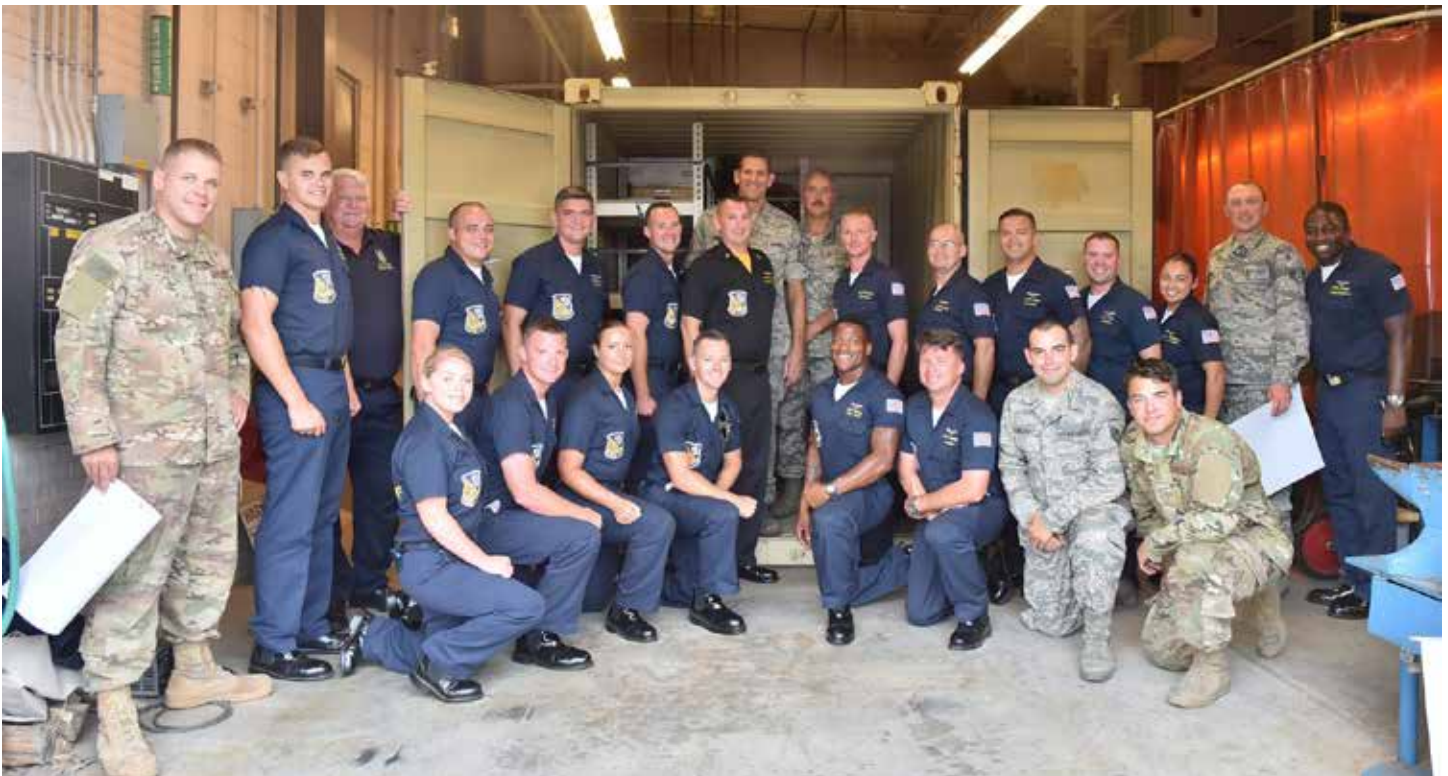
The Fabrication Flight showcased their capabilities at the 2018 Sound of Speed Airshow. The shop converted an ISU-90 into a deployable consolidated tool kit (CTK) for the Blue Angels.

We deployed four C-130 aircraft, along with maintenance teams and leadership to Fort Huachuca, Ariz. to support a seven day Operations and Maintenance Group AEF training event. The team provided mission ready aircraft to support a total of 1,899 operational