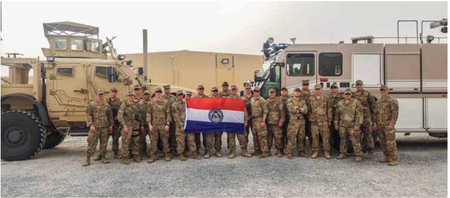
U.S. Airmen assigned to the 139th Security Forces Squadron, Missouri Air National Guard pose for a group photo while deployed to Al Jabbar Air Base, Kuwait.

arms. The 139th SFS combat arms shop is also tasked with the maintenance of all our squadron’s weapon systems. This results in a heavy work load for a depleted personnel shop. Each member of the combat arms program answered the call and conducted 75 training classes, more than double the year prior. Their hard work resulted in 638 personnel trained and qualified during FY18, which was instrumental in insuring our squadron and wing mission success.