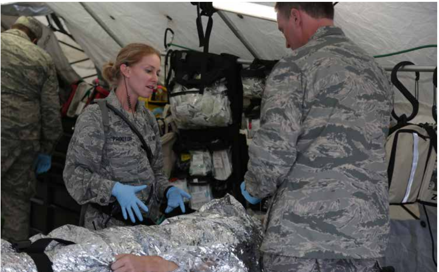
U.S. Air Force Maj. Allision Proctor examines a mock patient during a Homeland Response Force training exercise in Columbia, Mo., Oct 11, 2018.

group assisted in exercising and evaluating various operational and response capabilities, in addition to delivering public health and medical services to needy residents of south Texas. In total, 43,005 medical services were provided to 9,346 patients over the five-day event, including life-saving vaccinations, blood glucose screenings, school sports physicals, eye exams and dental exams.